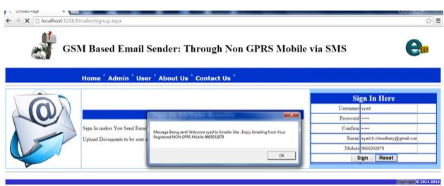
Figure 4.3 SMS sent on successful registration