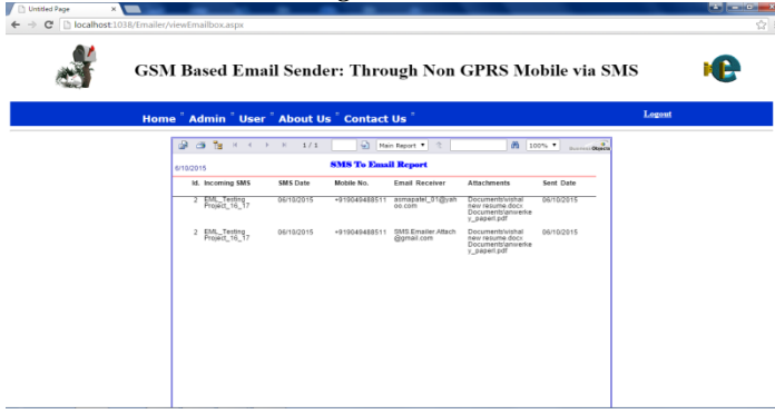
Figure 4.6 Administrator view Outbox Contents i.e. Outgoing Email