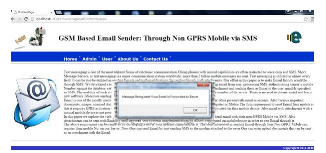
Figure 4.5 Forwarding Emails for User