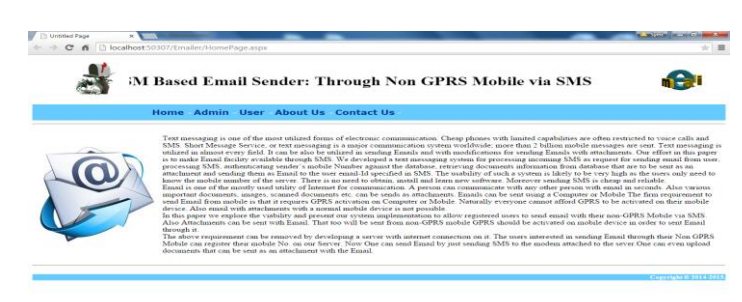
Figure 4.1 Web Interface

Administrator is also responsible for blocking and unblocking the users of the site. The other users are users who are going to use the services offered by the system. The users have to register on our site and must specify the mobile number that in future will be used to send and receive. The SMS received from registered mobile will only be used for send Emails.