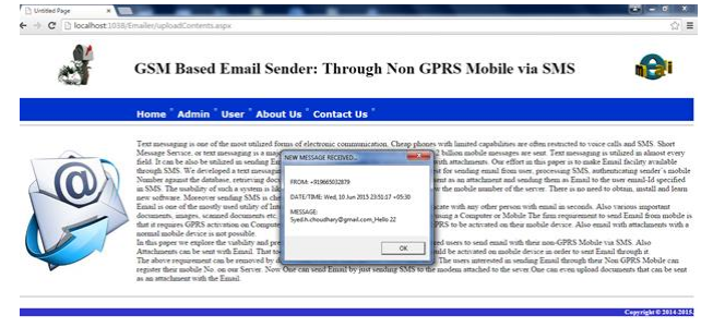
Figure 4.4 on Receiving SMS for Sending Email